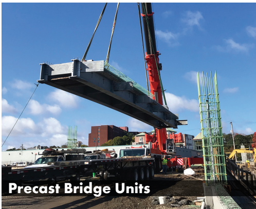
Precast Bridge Units