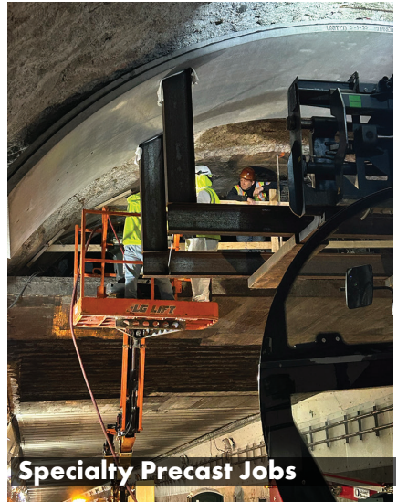
Specialty Precast Jobs