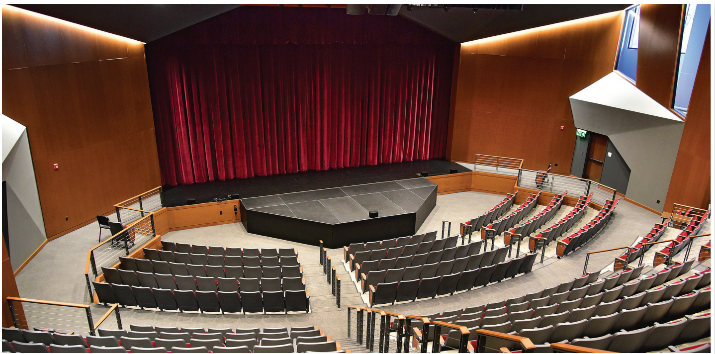
The Thomas S. Perakos Arts and Community Center • CM/GC: MID-SIZE NEW CONSTRUCTION