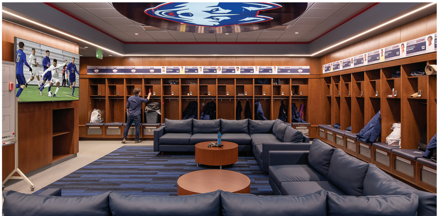
UConn Athletic District Development – Stadium • CM/GC: LARGE NEW CONSTRUCTION