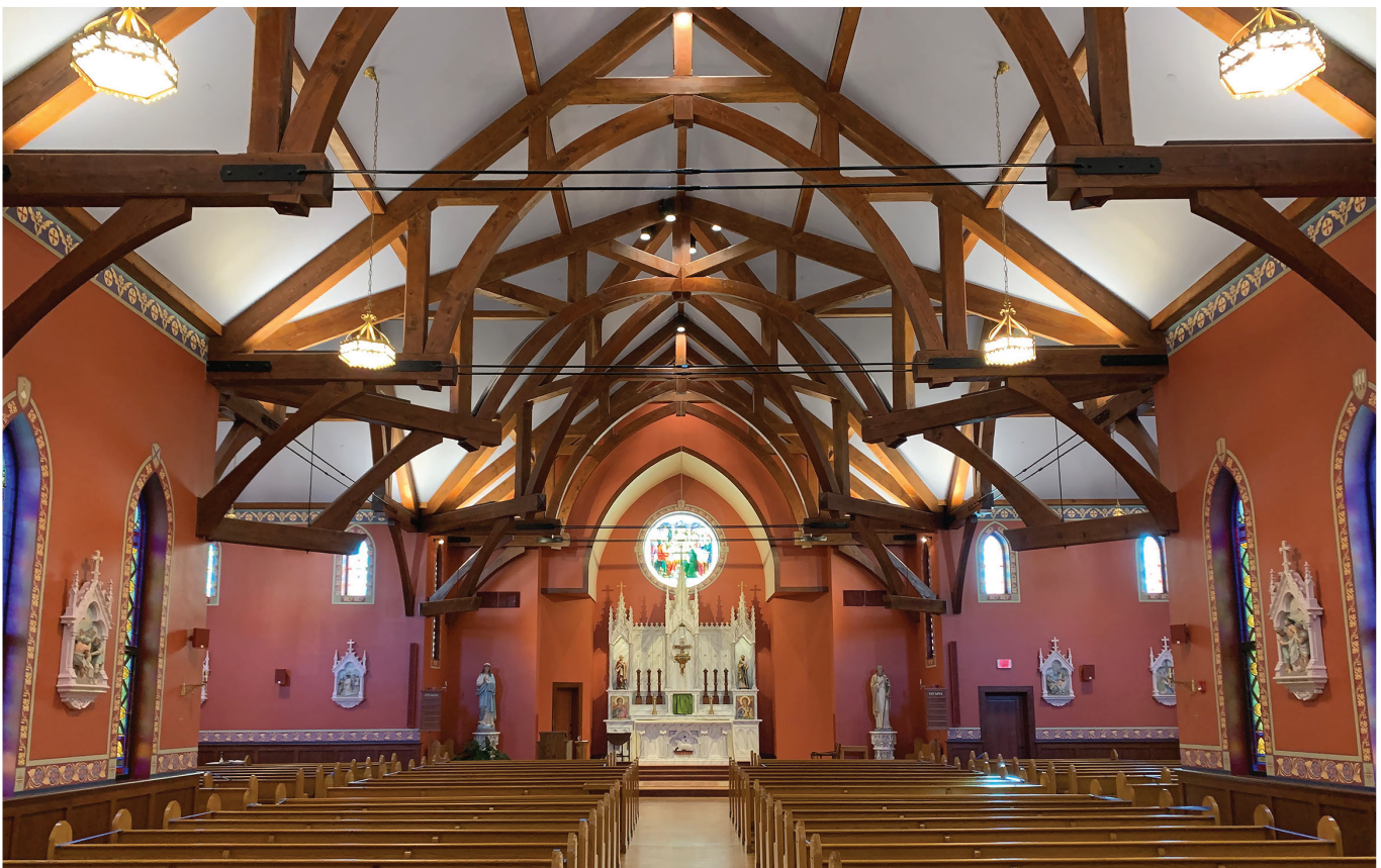
Saint Michael Church • CM/GC: SMALL RENOVATION