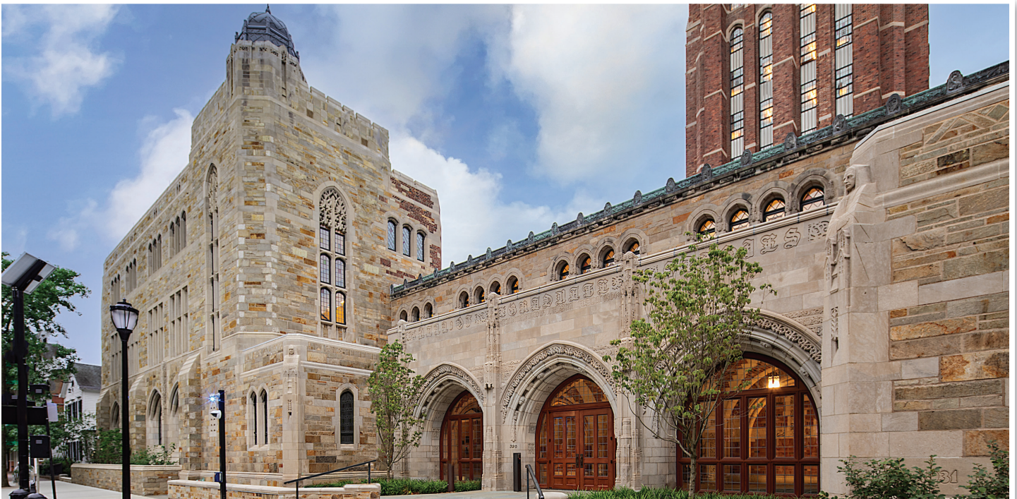
Yale 320 York Street • SPECIALTY CONTRACTING: MECHANICAL