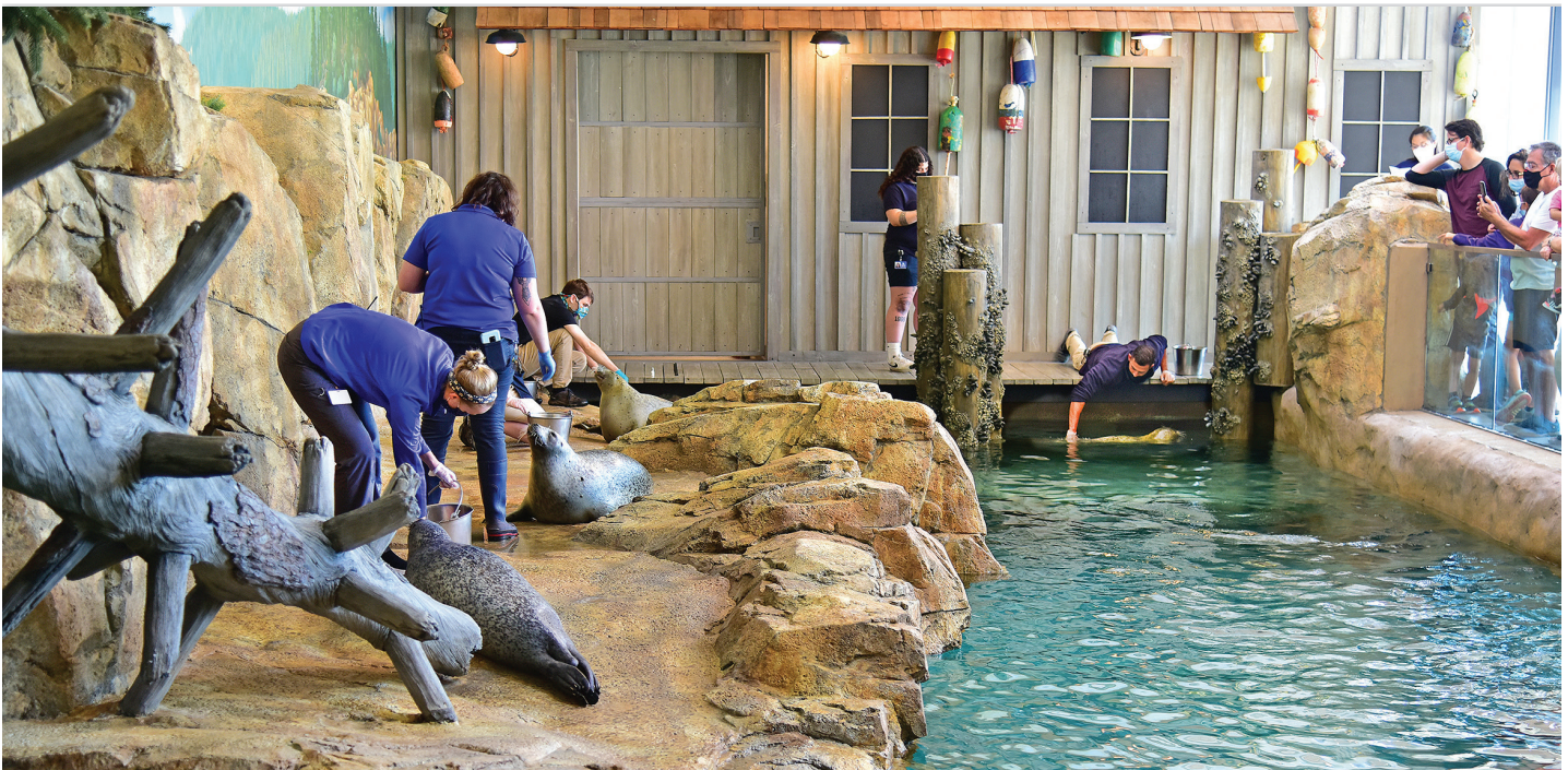
Maritime Aquarium at Norwalk Addition and Renovation • CM/GC: MID-SIZE RENOVATION