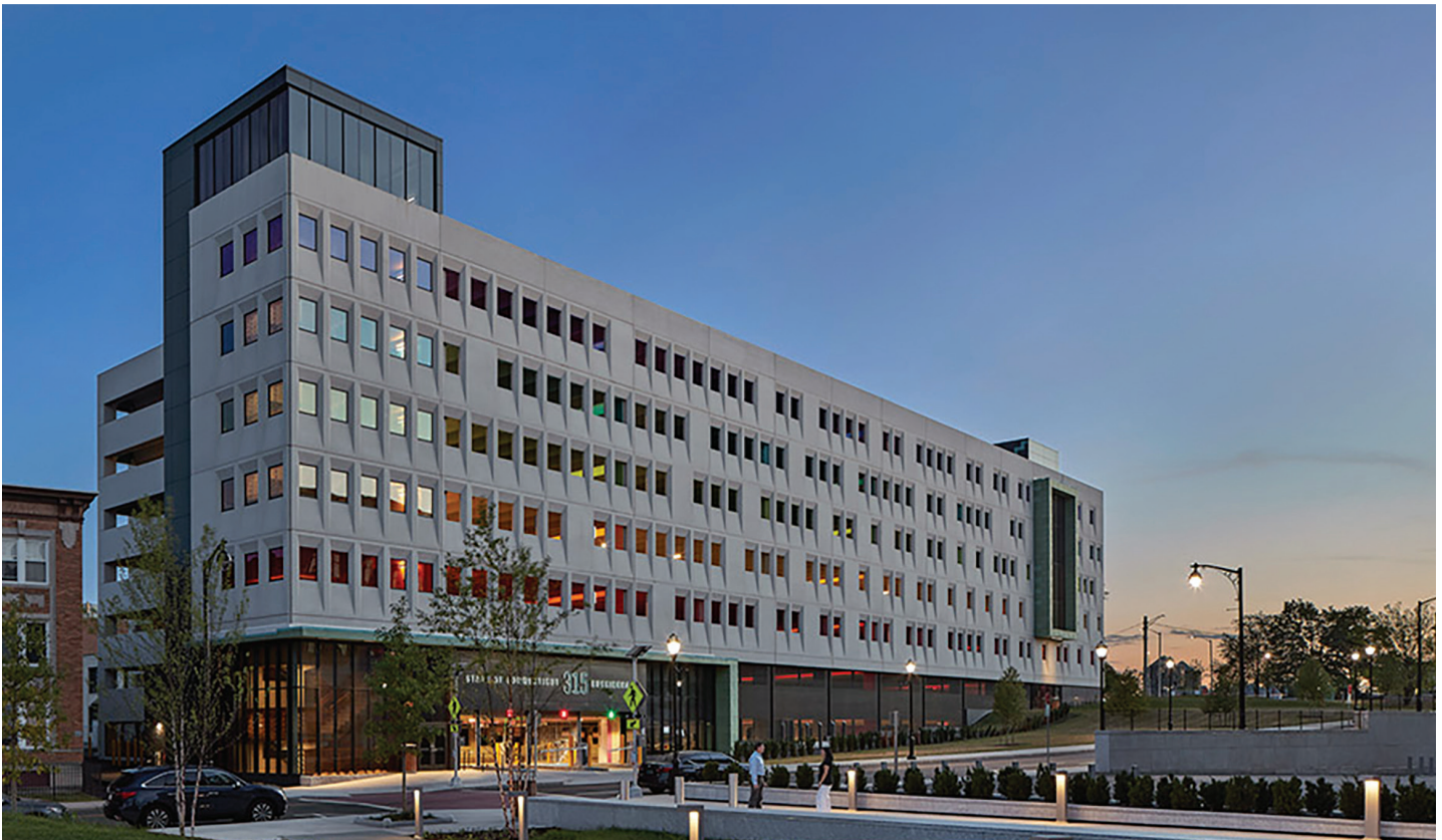
Connecticut State Office Building and Parking Garage • CM/GC: LARGE RENOVATION