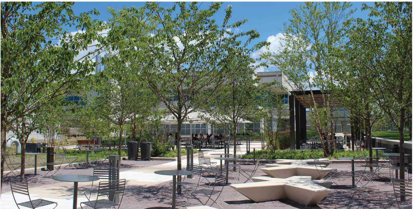
Yale West Campus Landscape Improvements • SPECIALTY CONTRACTING: SITEWORK/LANDSCAPING